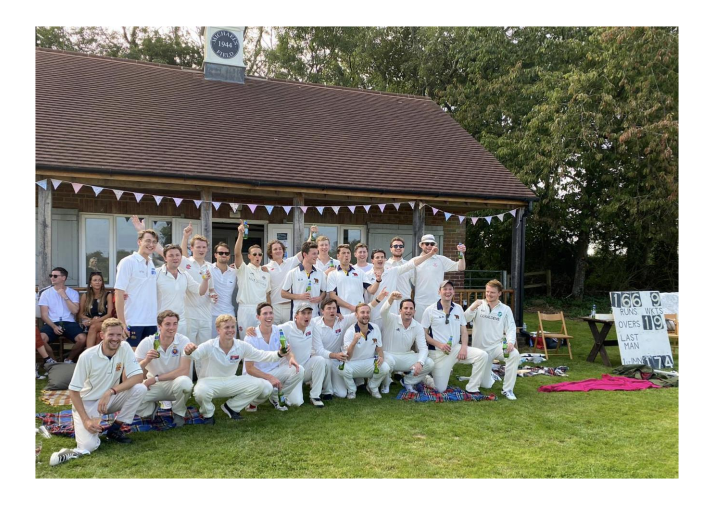
All proceeds from the hire of Michael's Field facilities go towards its upkeep.